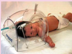
OH3000 Head Box Oxygen Neonatal