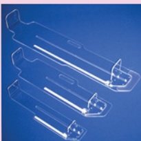
NWBLB35-70X Lengthboard Newborn PREMLB-X Lengthboard Premier