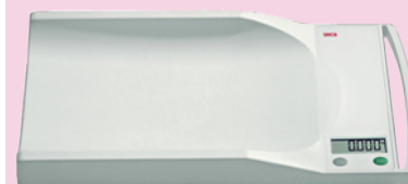
SECA334 Mobile Electronic Baby Scales 20kg