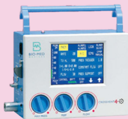
CV4400B Ventilator Transport Crossvent 4

CV2013 Pole Mounting Bracket Crossvent 10113 Spring Exhalation Valve Pulmonetic Ventilator HMV0027 Trap Moisture Humming Ventilator HMV0026 Tube Flex 10mm Silicone Humming Ventilator 500RD107 Tube Oxygen with Connector HMV0003 Valve Impedance Humming V Ventilator