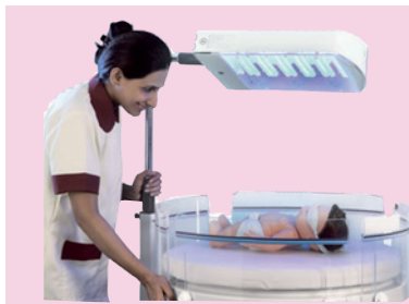
2036870001 Phototherapy System Lullaby