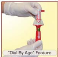
"Dial By Age" Feature