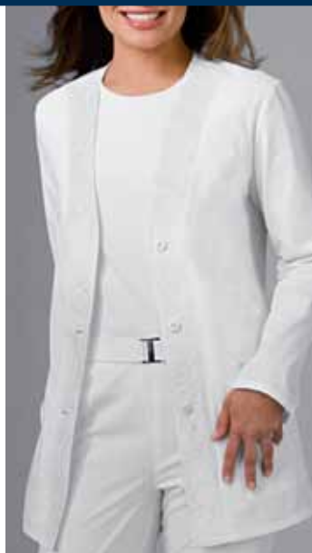
2332 - V-NECK CARDIGAN XS-3XL • White (WHTS) Brushed Cotton/Poly Poplin A shaped v-neck cardigan has feminine lace running down the front neckline and on the back belt. Princess seaming at back, side vents and two front patch pockets. Center back length 29½".