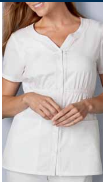
2733 - BUTTON FRONT V-NECK TOP XS-3XL • White (WHFT) 100% Cotton French Twill French twill novelty v-neck, with delicate lace edged button front placket, empire waist with all-around elastic, two front patch pockets, and side vents. Center back length 27".