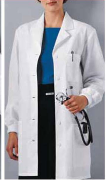
1362 - 32" KNIT CUFF LAB COAT XS-3XL • White (WHT) Cotton/Poly Poplin Stylish 32" lab coat features a notched lapel, two patch pockets, a chest pocket, button back belt detail for shape, side vents and knit cuffs. Center back length 32".