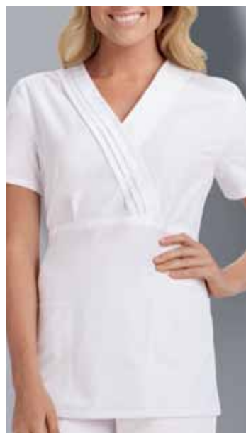
2873 - MOCK WRAP TOP XS-3XL • White (WHTC) Brushed Cotton/Poly Poplin A mock wrap top features front neckline pleats, contrast saddle stitch ribbon along front empire seam, patch pockets, side vents and back elastic for flattering fit. Center back length 27½".