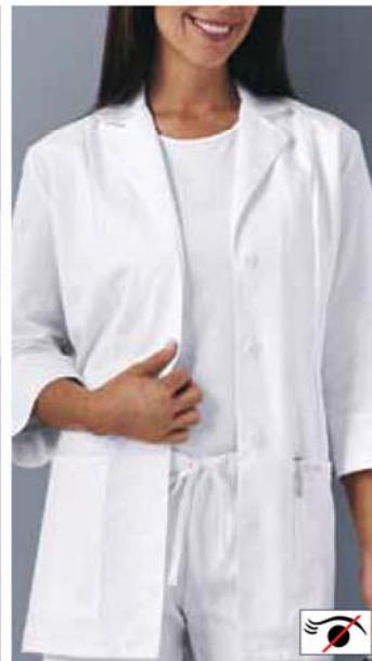
1470 - THREE QUARTER SLEEVE LAB COAT XS-2XL • White (WHT) Poly/Cotton Twill with soil release Notched lapels and three-quarter sleeves with cuffs. Princess seaming for easy shaping. Two patch pockets, side vents and back belt with button detail. Center back length 30 1/2".