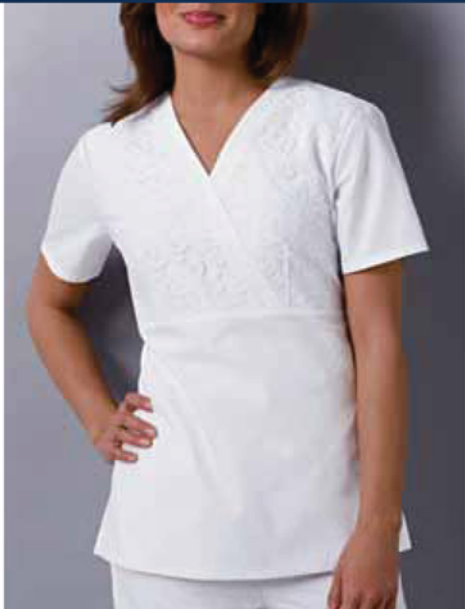
2930 - MOCK CROSS OVER TOP XS-3XL • White (WHTS) Brushed Cotton/Poly Poplin Feminine lace is placed all over the front bodice of an empire waist top. Rounded inseam pockets, side vents and adjustable back ties complete the picture. Center back length 26½”.