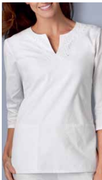
2791 - 3/4 SLEEVE LACE NECK TUNIC XS-3XL • White (WHTS) Brushed Cotton/Poly Poplin Three-quarter sleeve tunic features novelty keyhole neckline embellished by beautiful venice lace applique, front bust darts, front patch pockets, side vents, half back elastic for flattering shape. Center back length 27".