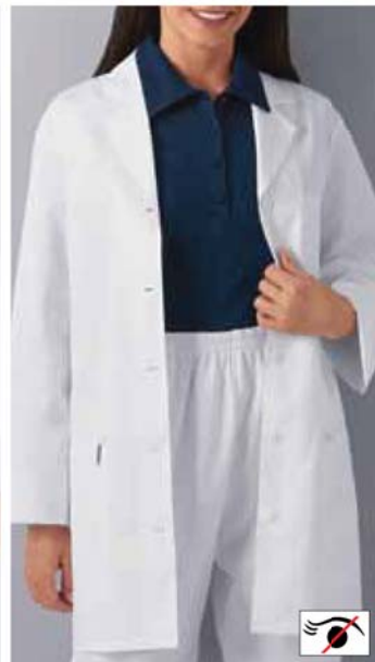
1462 - 32" LAB COAT XS-5XL • White (WHT) Poly/Cotton Twill with soil release Stylish, 32" lab coat comes with a notched lapel, two patch pockets, a chest pocket, button back belt detail for shape and side vents. Center back length 32".