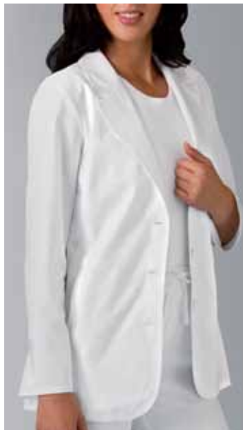
2362 - EMBROIDERED LAB COAT XS-2XL • White (WHTD) Cotton/Poly Poplin All-over floral embroidery enhances the front of this princess seamed lab coat. Two roomy inseam pockets, back princess seams and a back belt complete this style. Center back length 29".