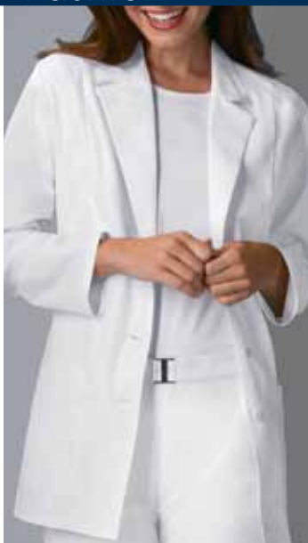
2321 - NOTCHED LAPEL LAB COAT XS-2XL • White (WHTD) Cotton/Poly Poplin Notched lapel lab coat has front and back princess seams. Two front faux flap pockets with pin tucks and a center back belt. Center back length 30".