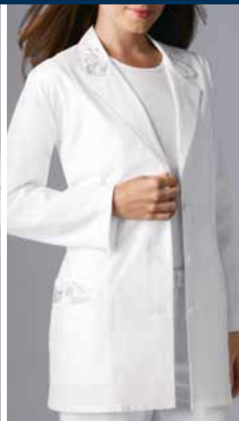
2350 - EMBROIDERED LAB COAT XS-2XL • White (WHTS) Brushed Cotton/Poly Poplin Notched lapel lab coat features embroidery on the collar and two pocket bands. Princess seaming in front and back for added shape and a center back belt. Center back length 30".