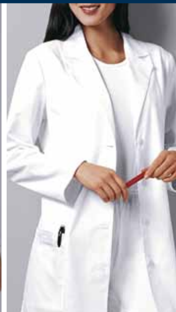
2351 - LADY LUXE LAB COAT XS-2XL • White (WHTD) Cotton/Poly Poplin Lab coat with notched lapel, front and back princess seams. Jacquard ribbon trims the pockets and a center back belt. Center back length 33".