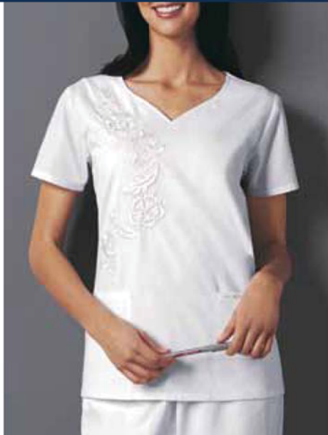
2942 - EMBROIDERED SLIM FIT TOP XS-3XL • White (WHTS) Brushed Cotton/Poly Poplin A slim fit, shaped top sports puff floral embroidery, sweetheart neckline, short sleeves and two patch pockets. Center back length 25”.