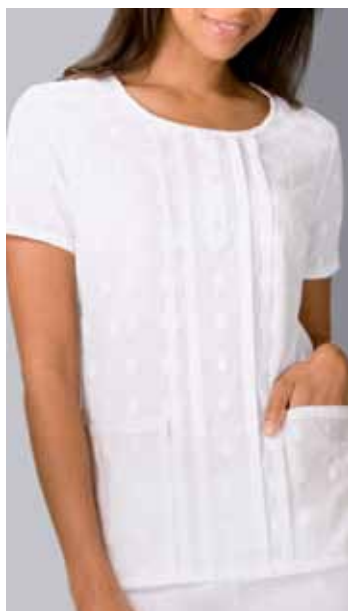
2763 - ROUND NECK TOP XS-3XL • White (WHCG) 100% Cotton Clip Geo A round neck top features a three button faux front placket between four rows of pin tucks, two rows of delicate lace trim at the shoulder, front bust darts for flattering fit, two front patch pockets, half back elastic and side vents. Center back length 26".