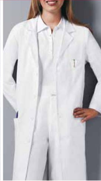
1346 - 40" UNISEX LAB COAT XS-5XL • White (WHT) Cotton/Poly Poplin A 40" unisex lab coat features two roomy patch pockets, a chest pocket with a pencil stitch and vented back. Center back length 40".