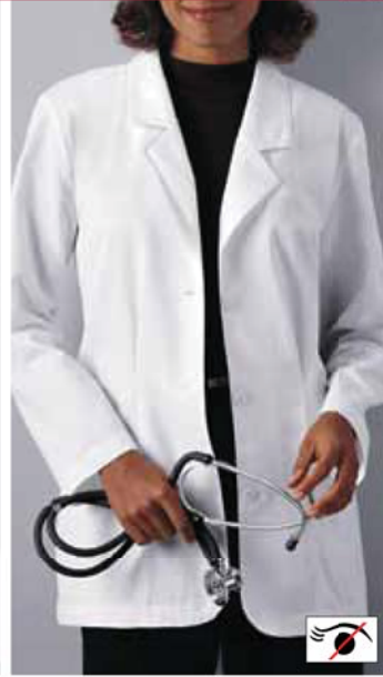
348 - 30" LAB COAT 4-20 • White (WHT) Poly/Cotton Twill with soil release Shaped 30" lab coat with notched collar, slanted patch pockets and cutaway front. Adjustable tie back belt. Center back length 30".