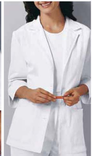
2330 - THREE QUARTER SLEEVE LAB COAT XS-3XL • White (WHTD) Cotton/Poly Poplin A 29" three-quarter sleeve, cuffed lab coat with lace on the collar, notched lapel and center back belt. Princess seaming and two patch pockets. Center back length 29".