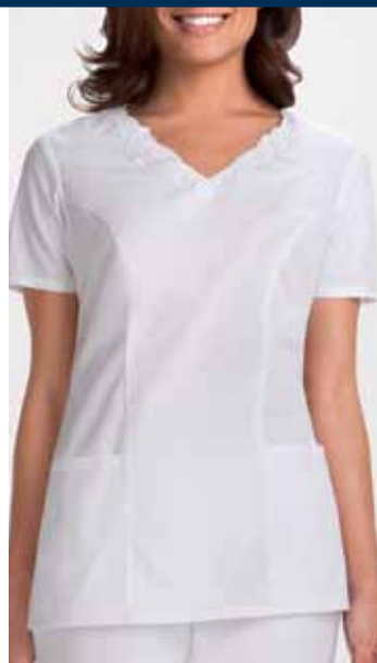
2741 - V-NECK EMBROIDERED TOP XS-3XL • White (WHTS) Brushed Cotton/Poly Poplin A v-neck top features beautiful vintage style cut-out embroidery around front neckline. Also featured are front princess seams, front patch pockets, side vents, and half back elastic for flattering shape. Center back length 26".