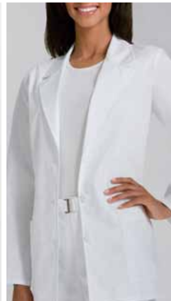
2390 - DAISY EMBROIDERY LAB COAT XS-3XL • White (WHTS) Brushed Cotton/Poly Poplin A notched lapel lab coat features front and back princess seams for flattering fit and front patch pockets. Pretty daisy embroidery on the pocket band and back belt complete this feminine look. Center back length 29½".