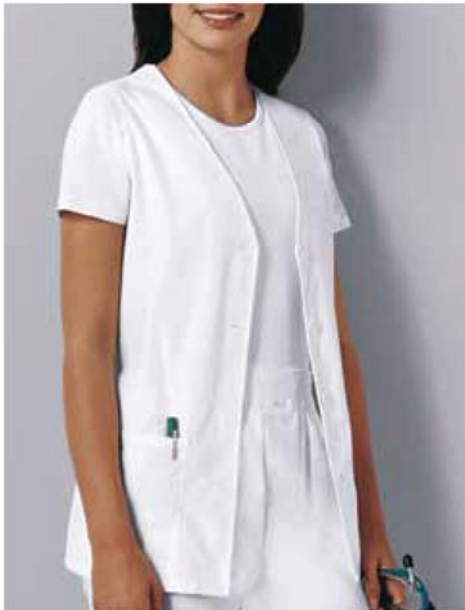
1602 - BUTTON DOWN VEST XS-3XL • White (WHT) Cotton/Poly Poplin A sporty vest with button front styling and two roomy patch pockets. Soft elastic shirring in center back. Center back length 29”.