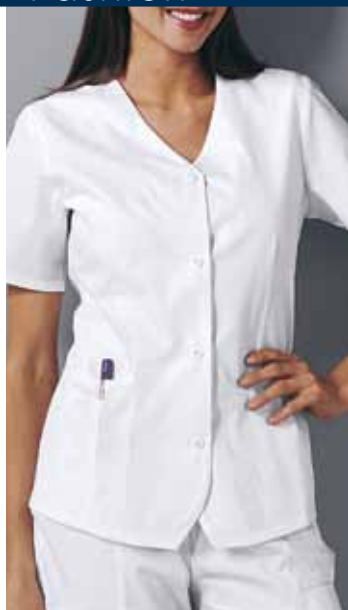
2680 - WESKIT TOP XS-2XL • White (WHTC) Poly/Cotton Poplin with soil release The weskit buttons down the front and is shaped in the center back with shirred elastic. Two patch pockets as well as a cell phone pocket. Center back length 24¾".