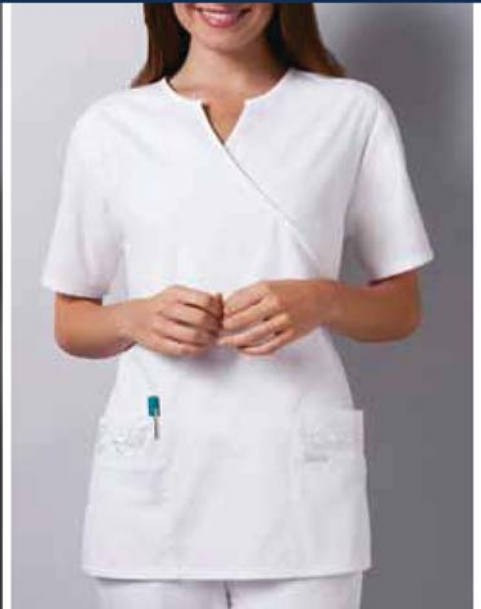
2951 - EMBROIDERED MOCK WRAP TUNIC XS-2XL • White (WHTS) Brushed Cotton/Poly Poplin Mock wrap tunic features embroidery on the bands of the two patch pockets. Side vents and adjustable back tie. Center back length 27”.