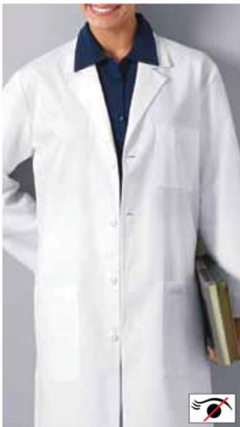
1446 - 40" UNISEX LAB COAT XS-5XL • White (WHT) Poly/Cotton Twill with soil release A 40" unisex lab coat has side access openings, two roomy patch pockets, a chest pocket with a pencil stitch and vented back. Center back length 40".