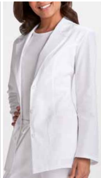
2371 - EMBROIDERED LAB COAT XS-3XL • White (WHTS) Brushed Cotton/Poly Poplin A long sleeve, three button, notched lapel lab coat features beautiful vintage style embroidery on the front patch pockets. Front princess seaming, a back belt and back princess seaming complete the picture. Center back length 29".