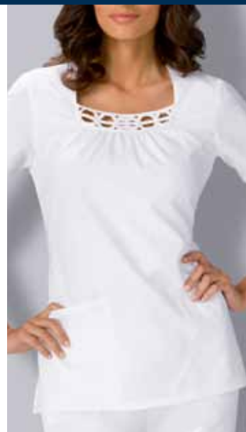
2751 - SQUARE NECK TOP XS-3XL • White (WHTS) Brushed Cotton/Poly Poplin A square neck trimmed in soutache gives this top a unique designer touch. Soft front shirring, angled patch pockets, half back elastic and side vents complete this look. Center back length 26½".