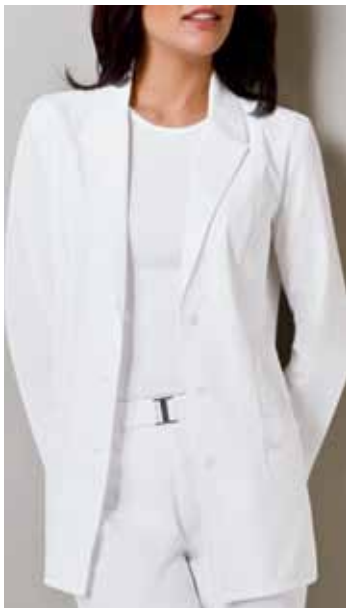
2360 - EMBROIDERED LAB COAT XS-2XL • White (WHTD) Cotton/Poly Poplin A notched lapel lab coat features all-over floral embroidery on the front princess panels. Two angled welt pockets, back belt and back princess seaming. Center back length 29".