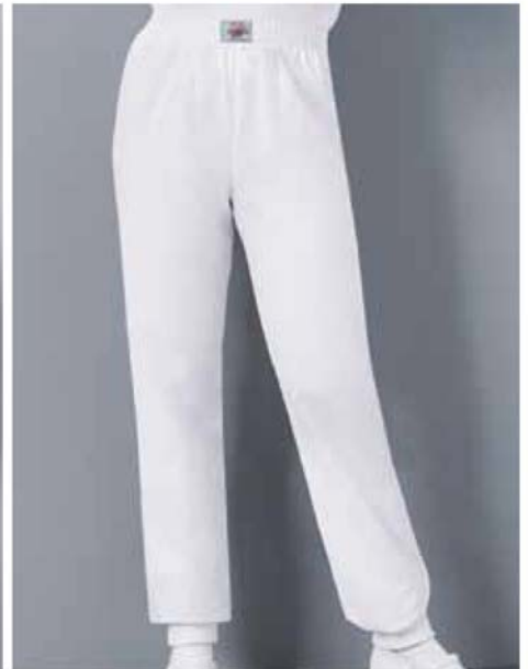
160 - RIB KNIT CUFF PANT XS-5XL • White (WHT) Cotton/Poly Poplin Elastic waist pant with matching rib knit cuffs, fancy waist label and two side pockets. Inseam 28½”.