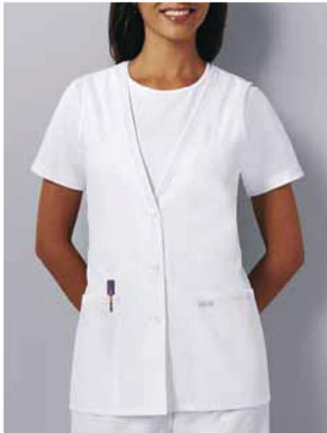
2610 - LACE TRIMMED VEST XS-3XL • White (WHTD) Cotton/Poly Poplin Feminine lace edges the v-neckline, the top edge of the patch pockets and the center back belt of a button front vest. Princess seaming gives soft shaping to the back. Center back length 28”.