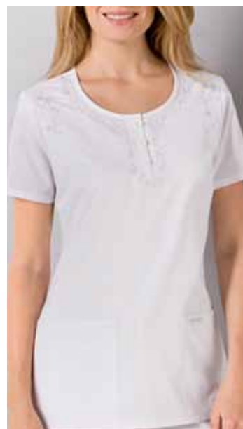
2893 - EMBROIDERED ROUND NECK TOP XS-3XL • White (WHTS) Brushed Cotton/Poly Poplin Round neck top with front button placket, features floral embroidery around neckline, front placket and armholes, patch pockets, side vents and center elastic for figure flattering fit. Center back length 27".