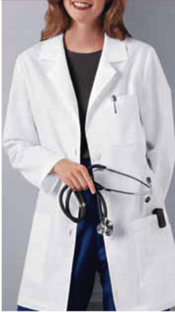
346 - 32" LAB COAT 4-20 • White (WHT) Cotton/Poly Poplin Longer length, 32" lab coat with notched collar and a multitude of pockets; chest pocket, two patch pockets, beeper pocket and inside cell phone pocket. Center back length 32".