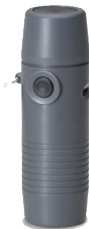
K206 Electrolarynx Solatone