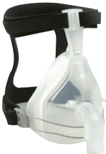
RT040 Mask CPAP Bi-Level with Exhalation Vents